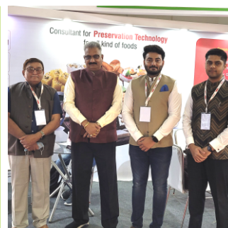
With Shri Vivekji & Shri Ayushji (Bikaner Elite - Patna)